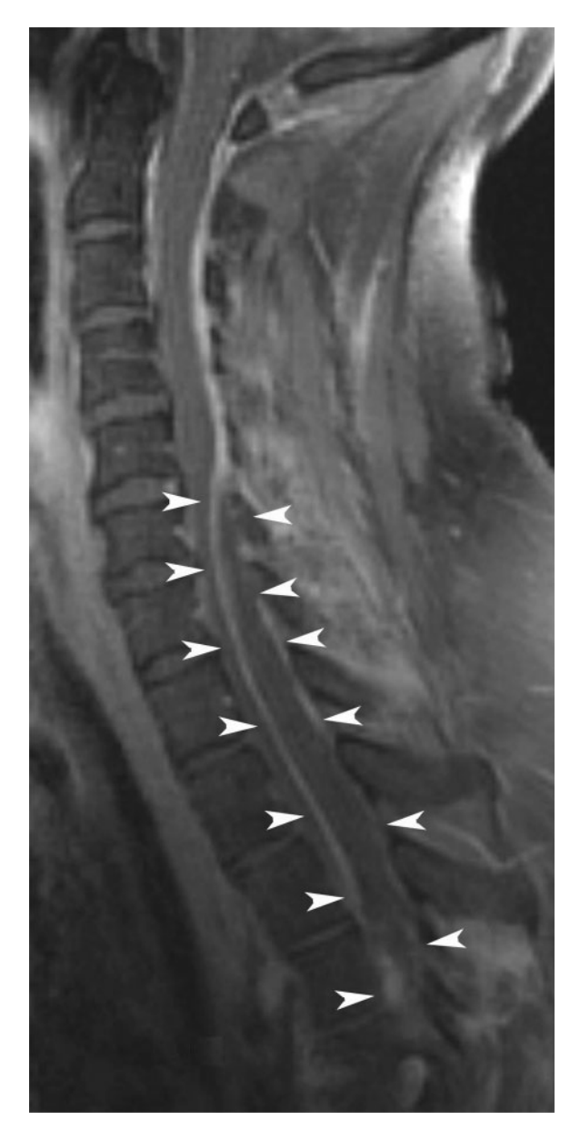
Figure 3. MRI. T1-weighted fat-saturated images after intravenous gadolinium, revealing a posterior SEA, from the vertebral level C5 to T5 (arrowheads).

antibiotics were administered. Two days after the CT scan, Gd-MRI revealed a SEA delineating from the vertebral level C5 to T5 (Figure 3).