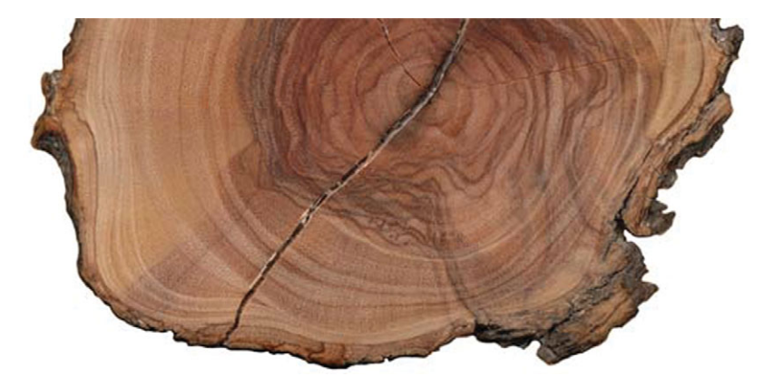
Figure 2. Cross-section of olive wood. Note the indistinct annual rings, caused by a lack of seasonality due to mild Mediterranean winters.

the putative tree-ring sequence of a single olive branch buried in the tephra on Thera (Friedrich et al. 2006). This evidence has itself been the subject of extensive dispute (Warren 2006, 2009; Wiener 2009a & b). These discussions focused on the oscillating nature of the radiocarbon calibration curve over the relevant period, which makes it impossible to distinguish on radiocarbon grounds alone between an event around 1610 BC and one around 1525 BC. Radiocarbon measurements from tree samples of this period securely dated by dendrochronology, e.g. German oak, give similar radiocarbon ages for the decades centred on 1605, 1585, 1575, 1555, 1535 and 1505 BC, as do Anatolian junipers from Gordion for 1620, 1570, and 1540 BC (Wiener 2010).