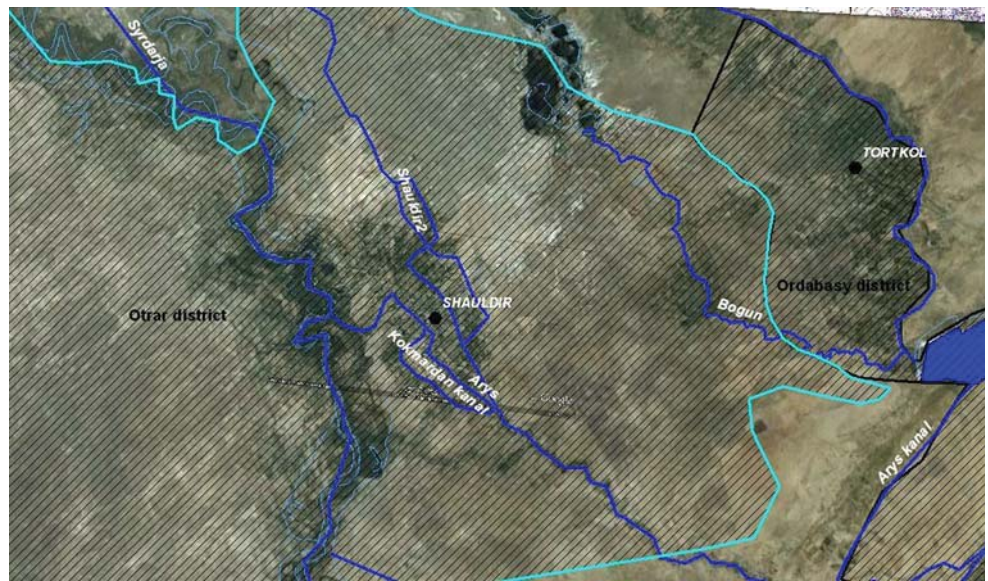
Fig. 5 GIS elaboration of a satellite image (Google Earth) representing the Otrar District and Shaulder irrigation scheme

RGP Iujvodkhoz members affirmed that the district authority ( Rayonnogo akimyat ) was no longer able to fund the District water department's operations. Therefore, the secondary canals probably will soon be under the jurisdiction of the RGP Iujvodkhoz . According to their members the state budget for water infrastructures nationally increased in the last 2 years; hence the management's shift could be easily conducted. As pointed out in Ordabasy District, the hypothesis that new WUAs would be established has been recently challenged since there has not been enough support shown by both the district water department and most of the water users. As mentioned above, only one WUA, named Mahambet, is nowadays working, since 2007, in the northern part of the district, supplied by the Bogun River. Due to this main water course, Mahambet WUA has been operating since the end of the 1990s, when it was founded as an informal water users association (AV), in connection with the RGP's Bogun branch instead of the district water department. Based on the Aktyube sovkhos administrative unit, 2,500 ha, the WUA staff includes only the director and three miraab ; the director also works as the accountant and hydro technician, having gained these competencies working as the head of Aktyube sovkhos during the Soviet Union time (Fig. 6).