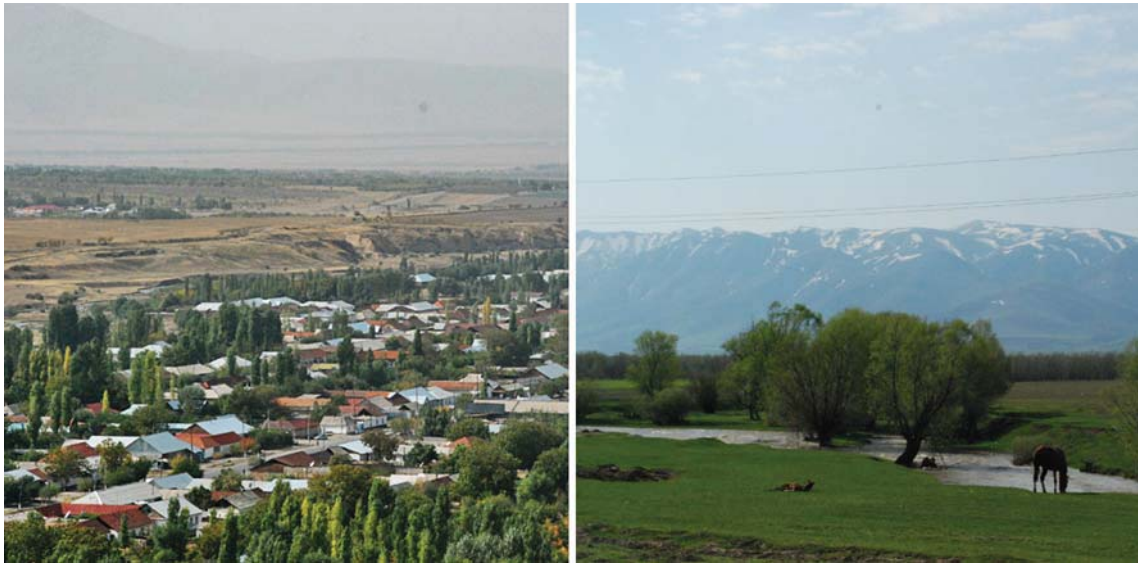
Fig. 6 Picture of upstream Arys Valley: Tyulkibas village ( left ), Arys River ( right )