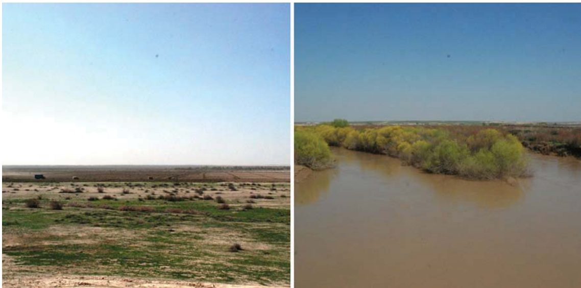
Fig. 7 Picture of downstream Arys Valley: Shauldir Province ( left ), Arys River ( right )

in comparison with other administrative entities, the local members of the water department had less hydro-technical knowledge and capacities. In addition, the district budget allocated to the water department in these years was lower in comparison to those of Ordabasy and Otrar. For the same reasons, particularly regarding technical capacities, the WUA in Tyulkibas also failed in 2012, after only 1 year. Although during the first years after the passage of 2003 law, the IMT process seemed to be successfully completed, with the new water users organizations fairly operating, in the last years several issues have emerged: data analysis has shown that the WUAs' organizational