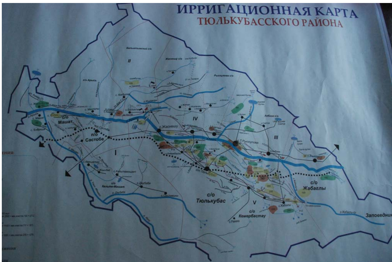
Fig. 3 Irrigation map of the Tyulkibas District

the state stopped financing district water departments), a small amount of water fees collected from the users and lack of technical staff to control and maintain the water facilities. Therefore, the association was reorganized in February 2011 and shifted its status to a WUA (SPKV); the Tyulkibas WUA was registered in the District Justice Department and, having received authorization, it leased from the district government ( Akimyat ) the secondary canals' network. Despite the institutional shift, no changes occurred in either organization or maintenance; the head of the WUA is the director of the former water department, the staff (an accountant a hydro technician and seasonal miraab ) has not changed, the water users have not been involved in WUAs' organization, and canals were not maintained despite an increase in irrigation fee. The WUA worked fairly only in 2011 although it has been affected by financial problems due to the water users' unwillingness to pay increased water charges. Farmers in Tyulkibas village stated that it does not make sense to pay fees to the WUA if it is not able to provide maintenance for the canals and fair water allocation (personal communication with the farmers, Tyulkibas, April 2012).